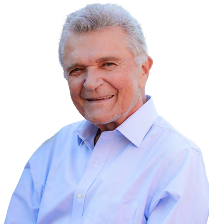
Manfred Swarovski Founder

The SWARCO CSR playbook serves as a comprehensive guide for our CSR initiatives. It provides a roadmap for integrating CSR into our daily business, guiding decision-making and driving meaningful social and environmental impact while creating long-term value for all stakeholders.